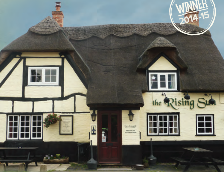
The Rising Sun, Ickford